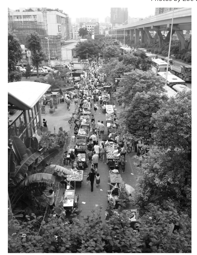
Figure 1. Da Fen Urban Village Street Life — market stalls, trading, historic traces, community gathering and playground.