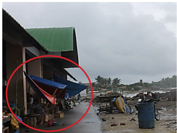
Figure 6. Circled in red are residents of Matnog who are selling food outside the Bus Terminal area.