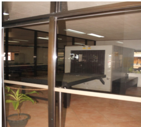
Figure 4. Left: Scanning area of bags upon entrance Right: Inside the Pier where passengers enter and wait.