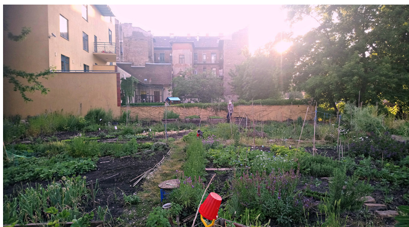
Picture 3. Grundkert from the eastern edge of the plot.

One of my main research sites is Grundkert ( Picture 3 ), a bottom-up nature garden in the 8th district of Budapest (officially called Józsefváros), where symptoms of city transformation processes such as building re-