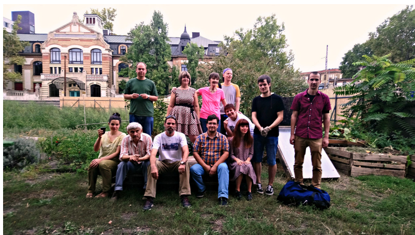
Picture 4. A few community members in annual meeting in the third location.

"I guess we moved enough with the garden to say it's not a certain area that defines the community. I think it probably goes on if we find another plot to continue... If so, then the greater part of the commu-