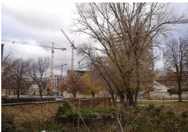
Picture 8. The property line of Grundkert with the construction on the background. Own photo, 2017