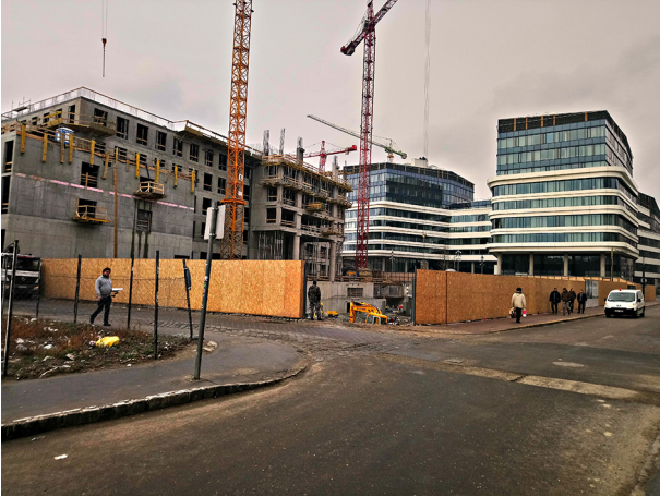
Picture 1. The rising blocks of Corvin-Quarter from Tömő street. Own photograph, 2018