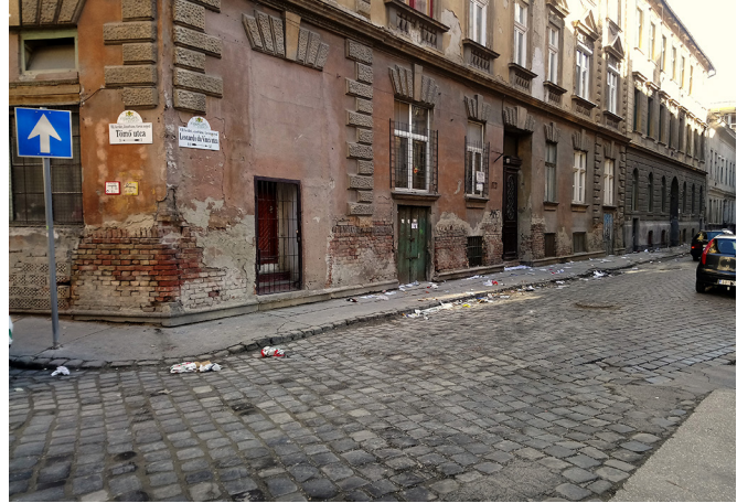
Picture 2. The undeveloped part of the district, down the street.

towards green demands, which can be captured in the actions, discourses and debates of community life. Criticism means a wide scale of phenomena from mere presence of the community in an “ unconventional place ” to debates and comments on local events, since mega-projects with the promises of advancement do not fulfil the expectations of local communities, and provide no real answer to the miscellaneous social problems rooted in the neo-liberal economic structure. (Földi 2009: 32)