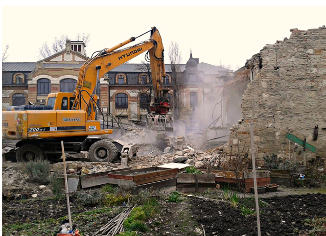
Picture 5. The days of destruction in February. Photo by János Tölgyesi, 2018

Such an intense utterance of unbalance, I suppose, refers to existence of deeper attachment, even though, as we saw previously, many gardeners considered the actual garden site less important. A few days later many gardeners joined together in the garden to remove fallen bricks and dust from the plots that used to be by the edge of the wall. It turned out that the investment company did not inform the community on purpose, since it was winter, and indeed not the gardening season. Members resented the lack of adequate communication from the company, as it increased uncertainty. (Picture 6)