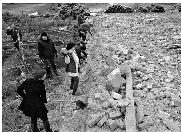
Picture 6. Gardeners removing the debris from the flowerbeds. 2018